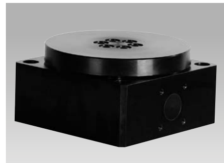
Rotating module - vertical axis DMV 1000 with flange plate Ø 170